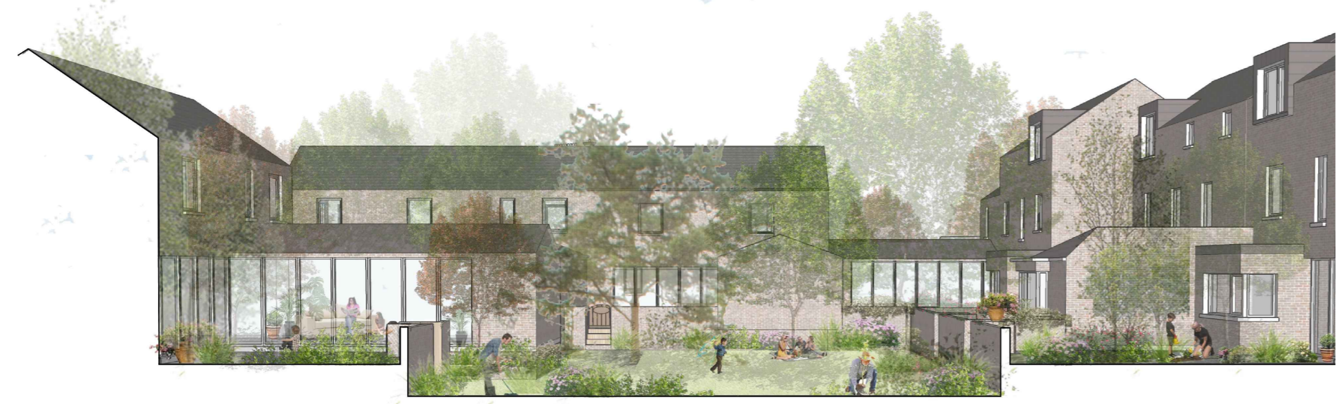
RENDERED PERSPECTIVE SECTION DEMONSTRATING THE CHARACTER OF THE COURTYARD CLUSTER NOTE: NOT TO SCALE