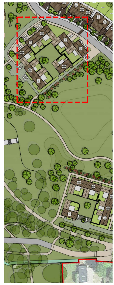
KEY PLAN INDICATING POSITION OF NORTHERN COURTYARD HOUSES NOT TO SCALE